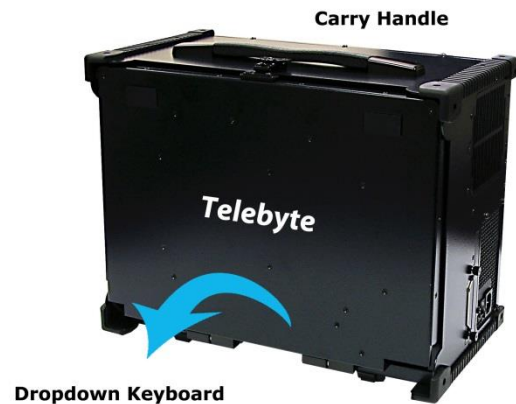
Portable, high-performance PC (semi-rugged for use in the field). Includes built-in monitor and dropdown keyboard.