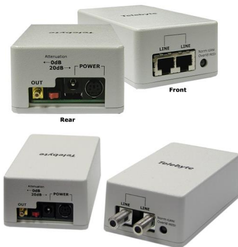
Probes for twisted pair and COAX.